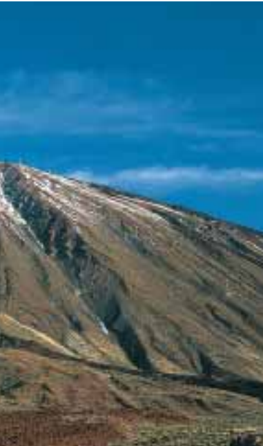
The Teide seen from Roques de García

which, due to their different positions are also of two quite different landscapes: one desert-like, the other wooded. One should consider both the geological and climatic diversity.