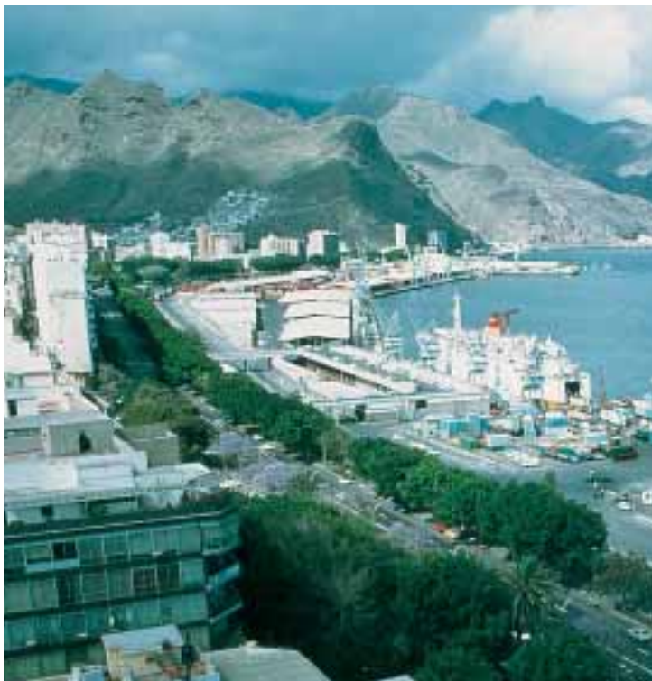
Santa Cruz de Tenerife Island Council House of Tenerife Our Lady of Africa – Market

The most frequented place in Santa Cruz is La Plaza de España by the sea, where the building Cabildo de Tenerife stands. Castillo, the commercial street par excellence, of the city starts from Plaza de la Candelaria which is at the side. Behind it is the sixteenth century church