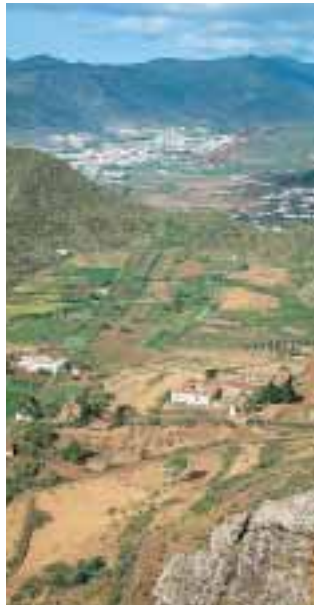
Landscape – La Laguna

There are other roads that go over this highland many of which end in quaint "caserios" perched on the