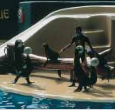
Loro Park – Puerto de la Cruz

Leaving Puerto de la Cruz towards la Laguna by the highway, one takes the detour to Tacoronte. From there one goes 10 kilometres further to Bajamar and another two kilometres to Punta del Hidalgo where one gets beautiful views over the sea of the Anaga highland ridges.