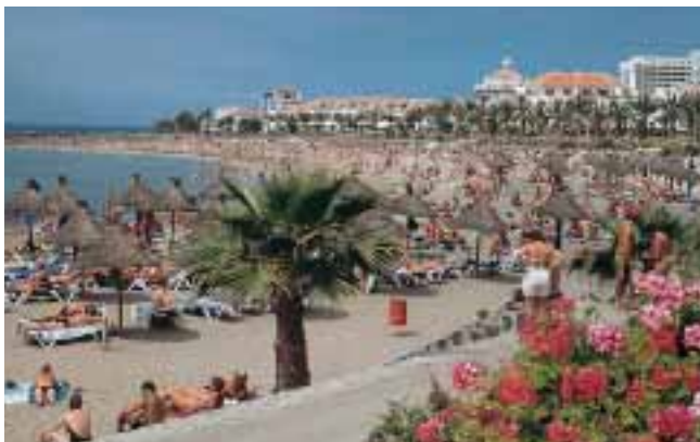
Playa de Las Americas

enjoyment of both sun and sea as well as all the countryside of Tenerife which is easily accessible by road in one day.