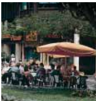
Street Café – Santa Cruz de Tenerife

eighteenth century church of the same name stands, starts from this square. This street leads to what is possibly the finest place in Santa Cruz, the park of Garcia Sanabria where lush trees from all over the world stand out from dense exotic vegetation.