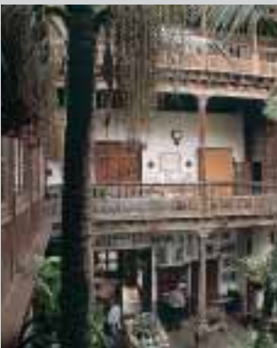
House of Balconies – La Orotava