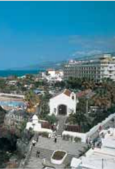
Puerto de la Cruz San Andrés

way one came and take the left turn towards el Bailadero. From el Bailadero it is possible to go down to Taganana and Almaciga to the left and go straight on as far as Chamorga, approaching the peak of the highlands or do both things. The three options mean returning to el Bailadero from where one travels south towards San Andrés. This village shelters the beach of las Teresitas where one can bathe. The beach lies at a distance of eight kilometres from Santa Cruz and from there another thirty six kilometres to Puerto de la Cruz.