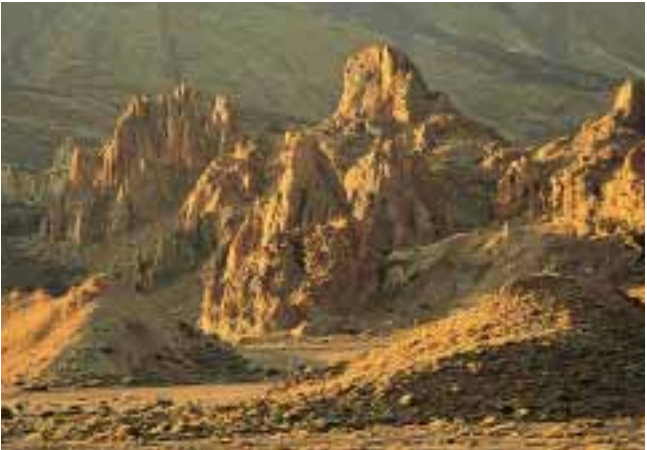
Teide National Park. Ucanca Plain

Proceeding from the coast to the impressive heights of the Teide climbing above the clouds contemplating the grandeur of Los Gigantes cliffs, exploring the dense Anaga woods of laurisilva, strolling through the pine woods in the centre or just contemplating the beauty of the Orotava valley are singular experiences which need no more effort than to travel a little way.