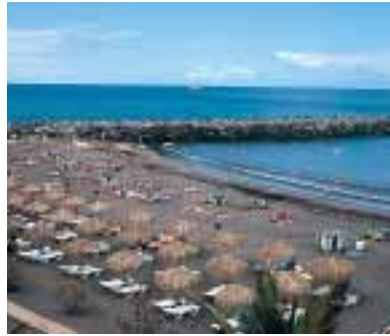
Playa de Las Américas

This has permitted the conservation of large virgin areas which keep all their natural wealth. The Wildlife Park Macizo de Adeje and Barranco del Infierno are also near this area of great scenic and botanical worth.