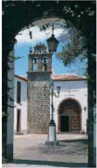
Church Of San Francis – La Laguna

The city began to lose its leadership when the port of Garachico was destroyed by the volcano so causing the fast development of Santa Cruz