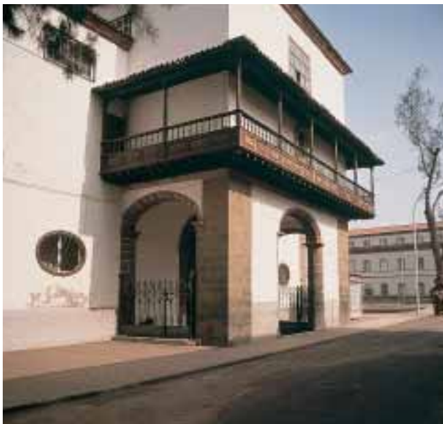
Conception Church – Santa Cruz de Tenerife