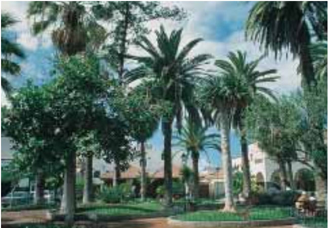
Puerto de La Cruz

The magnificent climate of the Canary Islands with no winter and where, even in summer the heat is not sweltering, is due to various factors which together have given rise to the rich nature of the islands, full of native flora and fauna. The position of these islands, under the influence of the