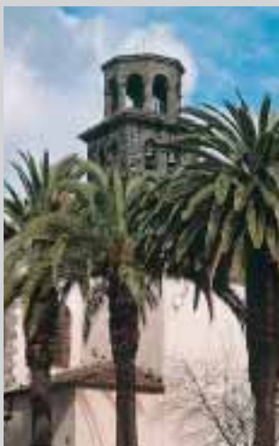
Conception Church – La Laguna

This route goes along the dorsal range of Tenerife climbing slowly from la Laguna up 2,000 metres of las Cañadas in 43 kilometres. This is the most advisable way