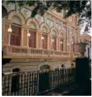
Santa Cruz de Tenerife. Casino

had a maritime park designed by Cesar Manrique, where the old trade docks are used for recreation.