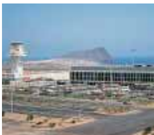
Reina Sofia Airport – Santa Cruz de Tenerife

From Tenerife it is easy to reach the rest of the islands, either by plane, ferry or jetfoil. La Gomera and Grand Canary having the best services. Both are reached by sea in less than an hour and a half so